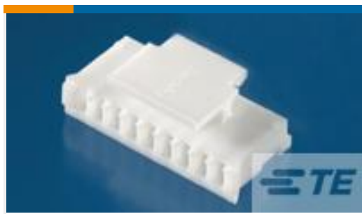
TE Part # 1-1735447-1 HPI 2.0 RECEPTACLE HOUSING, 11P